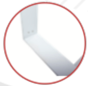
Toolless locking mechanism

The backlit rollable panel has preinstalled LED's that ensure the display graphic is vibrant and impactful. The panel is inserted into the frame in the same way as a standard SEG graphic making it easy to assemble. It also has the option to have a rear facing unlit textile graphic if required.