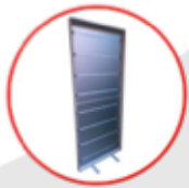
Single Sided Back Lit stand

Padded compartmented travel / storage box comes with full instructions and carry handle.