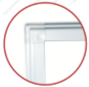
Double rear channel for non-lit rear graphic